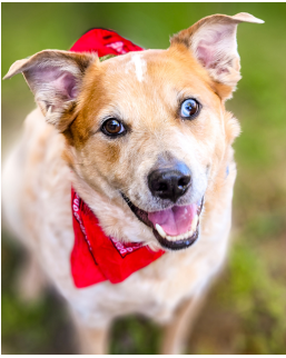
Meet Maximus Blue.

He greets all with a wagging tail and a happy smile. He's great with other dogs and he is good with kids. He LOVES to go for walks and he also enjoys car rides. He's very well behaved and has excellent manners. He's completed training courses and knows lots of commands! From Sit, Down, Stay, Shake, and even Speak! That's only the top of the list of knowledge. Max is house trained. He walks great on leash and